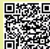
QR code to download Megh App