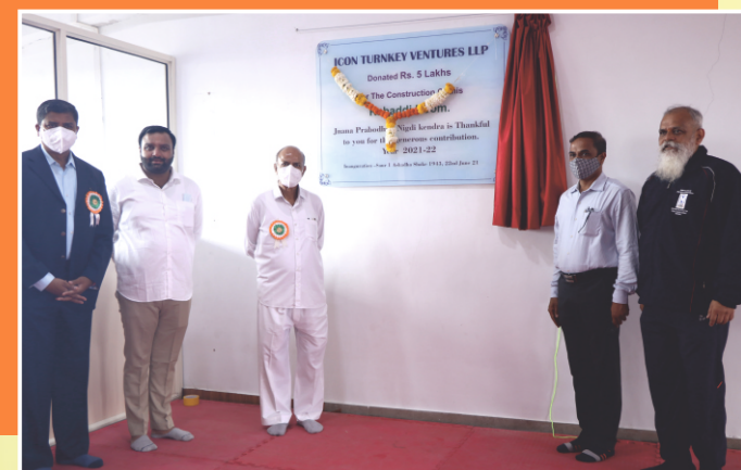
Inauguration ceremony of Harshadraay Ratilal Karia Kalabhavan at Nigdi centre.