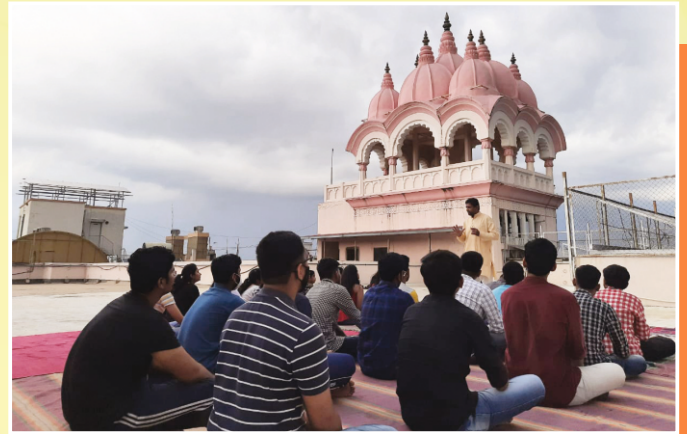
Open air Session of Leadership Development Centre