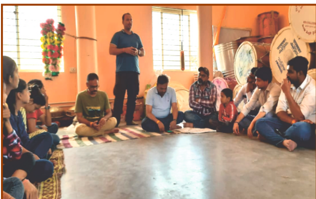
Volunteers of Yuvak Vibhag interacting with members of "Swar Pathak" at Indore.