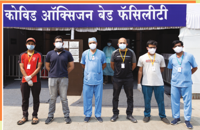
Volunteers at temporary Covid care hospital at Ganesh Kala Krida Manch, Pune