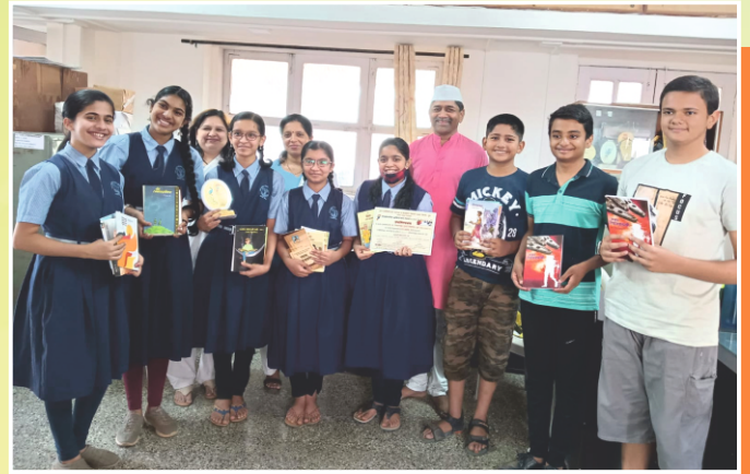
Students of Golwalkar school who won Abhivaachan competition organized by Chhatra Prabodhan