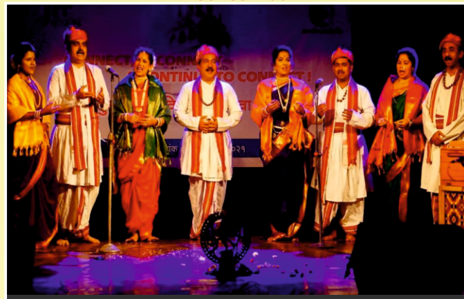
Naandi performance by artists and alumni at the joint alumni meet of Nigdi and Pune.