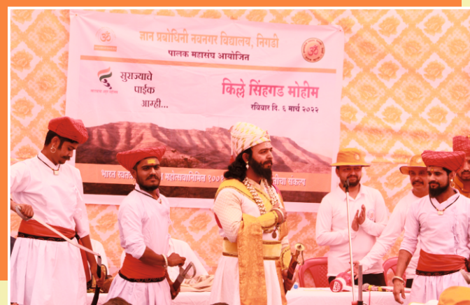
1,000 parents of Nigdi Centre undertook Sinhagad campaign