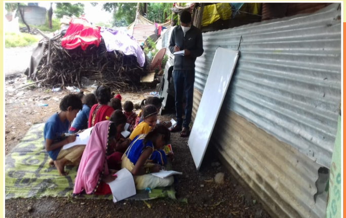
Activities at Shikalkari settlement at Ambajogai