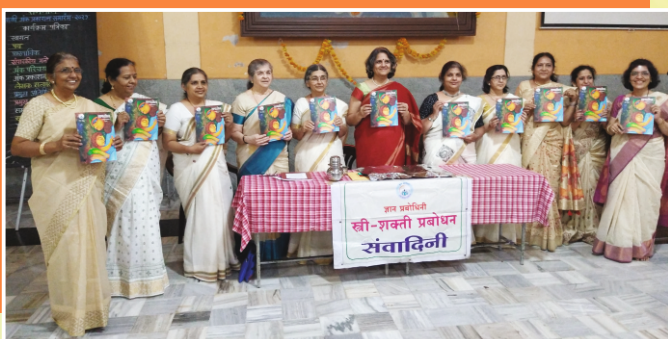
Samatol Diwali issue publication programme