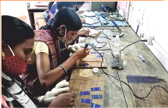
Training of making solar lamps and solar panels