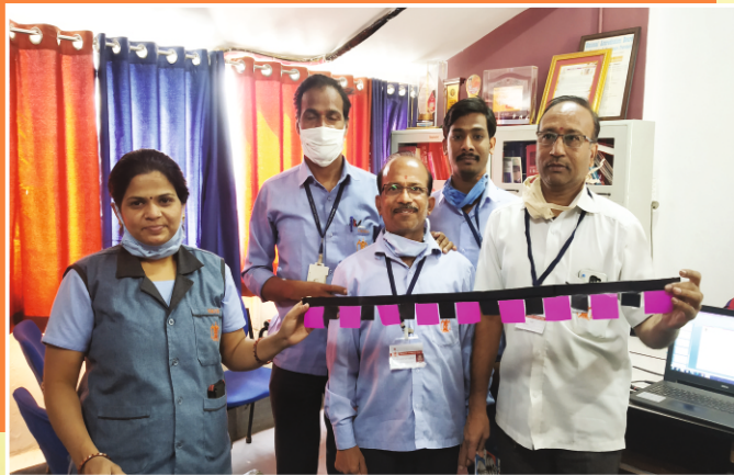
Industrial Training by JP Institute of Psychology