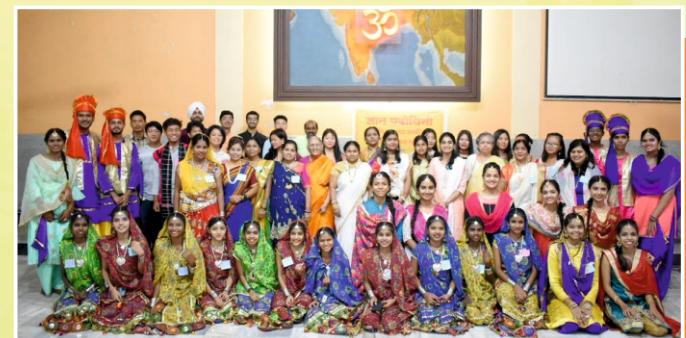
Participants in Rashtriya Ekatmata Mahotsav organised by Urban Slums Study Group