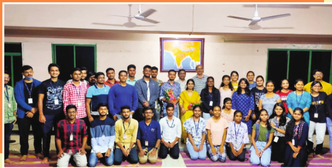
Students of Leadership Development Centre along with candidates who secured high rank in UPSC 2021