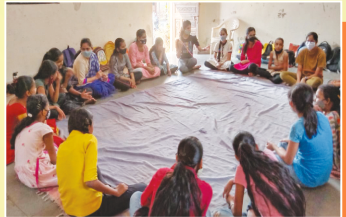
Prajna Prabodhan Class session by JPIP