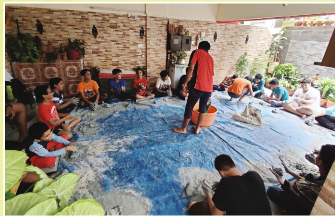
Workshop of Yuvak vibhag for making Shadu clay Ganesh Idol.