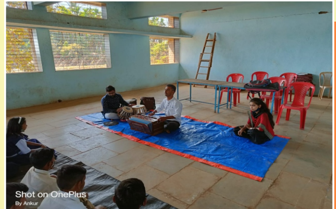
'Chhote Kalaakar' initiative at the Chiplun Centre