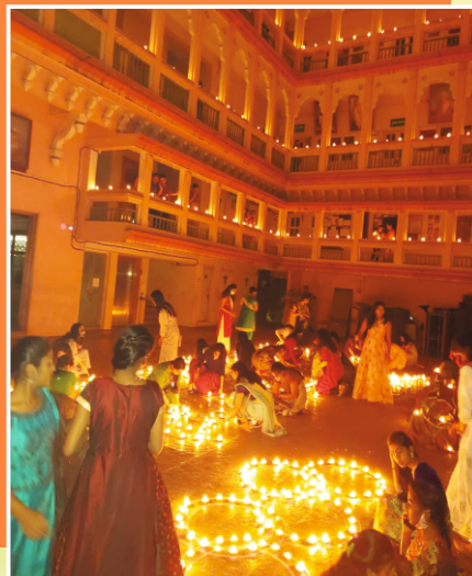
Deepotsav by Yuvati Vibhag in Diwali