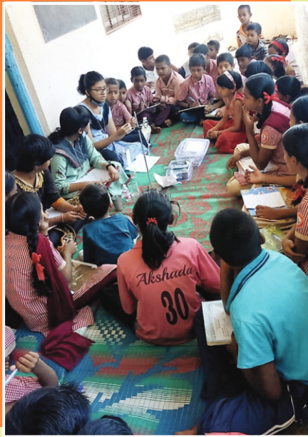
Science workshop by Educational Activities and Research Centre