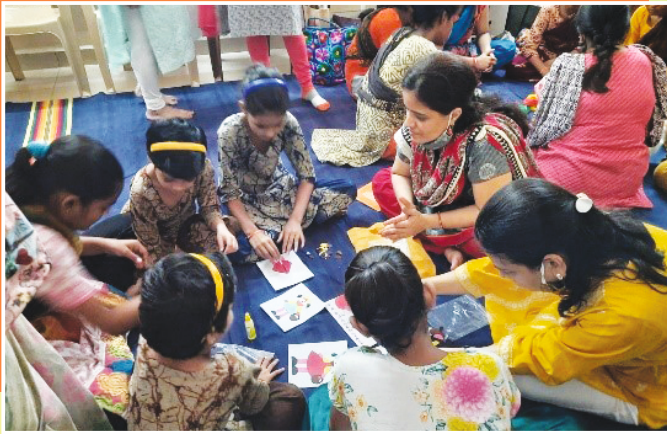
Thane centre volunteers visit the Aangaon Balika Aashram