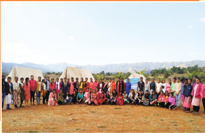
Tent camp for girls and women as a part of Aarogyasakhi project