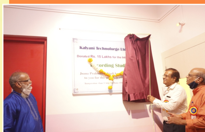
Inauguration of Recording Studio at Harshadraay Ratilal Karia Kalabhavan at Nigdi centre.