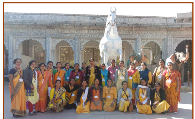
Volunteers of Stri Shakti Prabodhan (Rural) in Rajasthan Study Tour