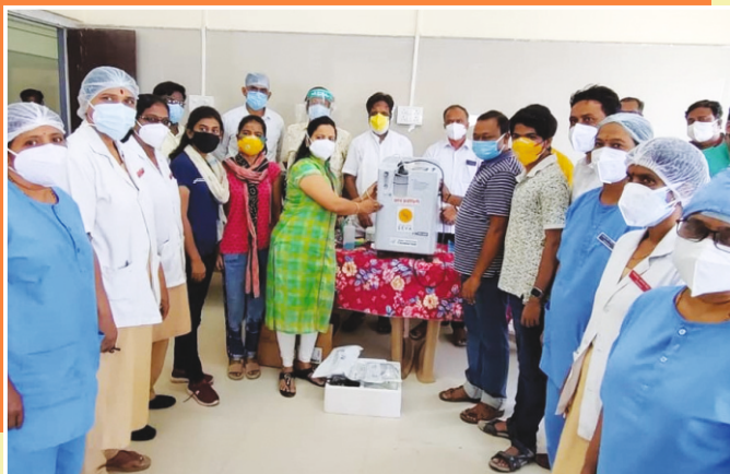
Oxygen concentrators donated to a hospital at Ambajogai