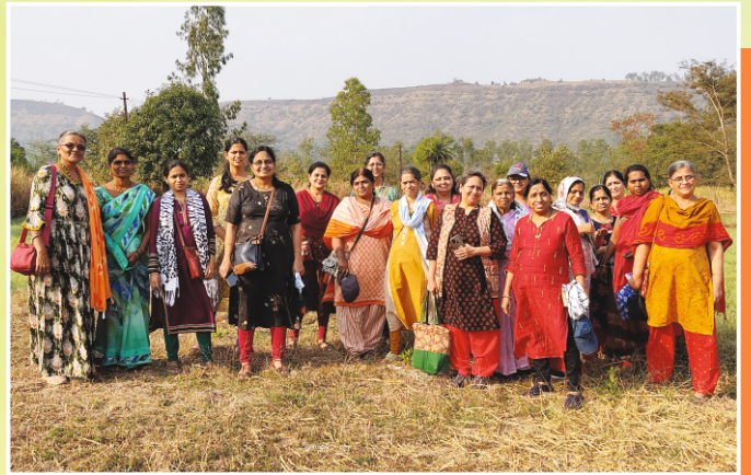
Rural field trip of Dombivali centre volunteers