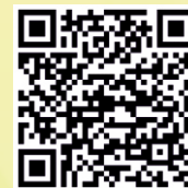
QR code to download Sarita App