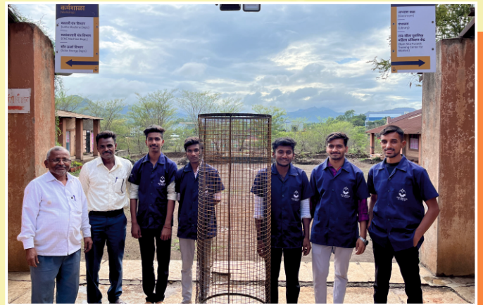
Tree guard made by students of Vocational Training Centre at Shivapur