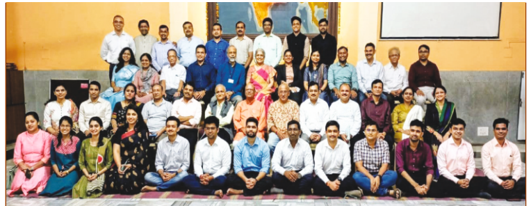
Meet of successful students of UPSC 2021 with Officers in Service