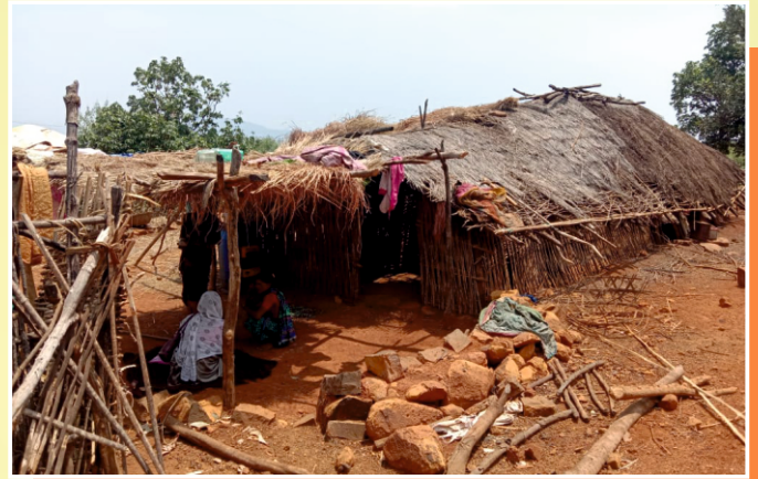
Survey during Covid-19 at Gunjawani by Stree Shakti Prabodhan (Rural) volunteers.