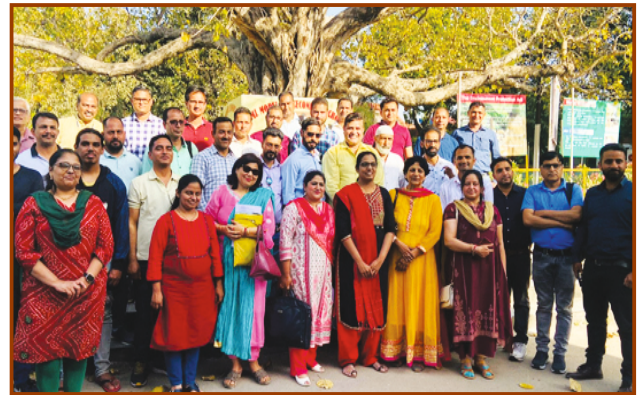
Members of Educational Resource Centre at Jammu, Poonch with trainee teachers there.