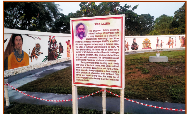
Vivek Gallery at RIWATCH, Roing in memory of Late Vivek Ponshe.