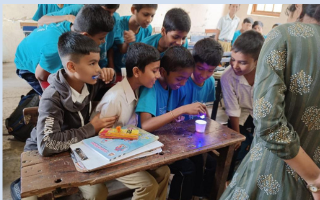
Demo Session of Volunteers in Pune