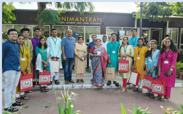
Officer Visit and Interaction