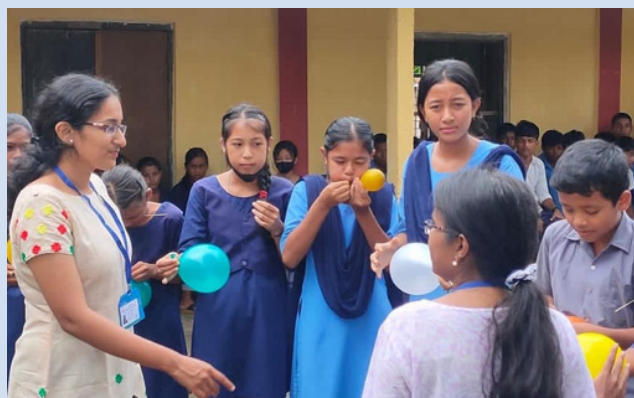
Science Activities by Volunteers in Schools