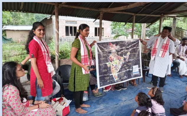
Know our Country Exhibition