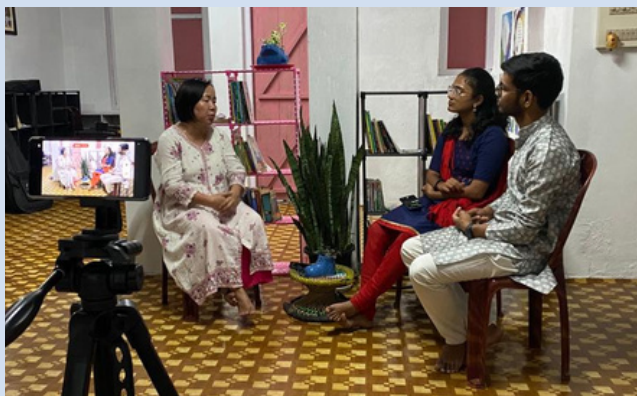
Interview of Local Personalities