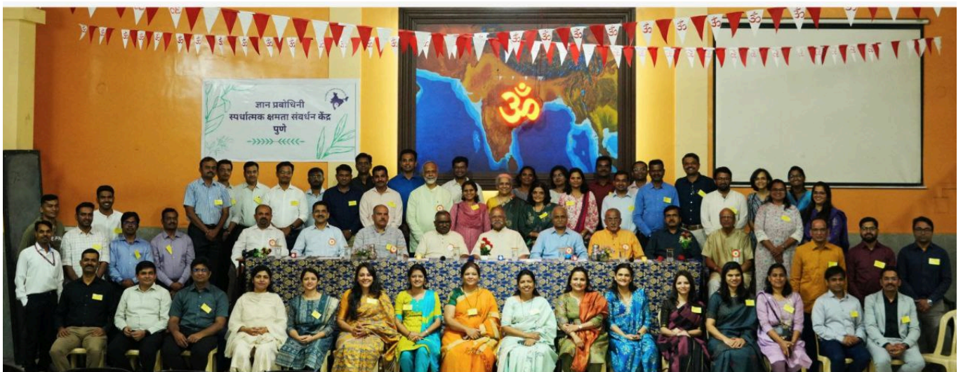
Jnana Prabodhini Officer's Network Meeting in Pune 2024