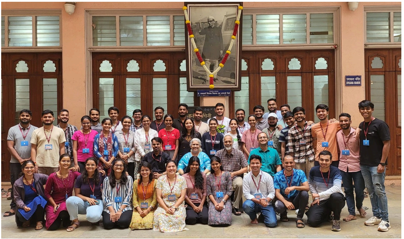
Complete Batch 2024-25