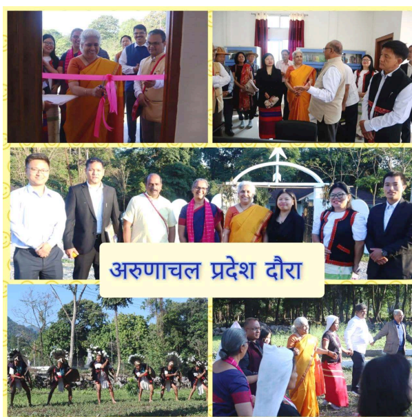
Glimpses of visit to Arunachal Pradesh