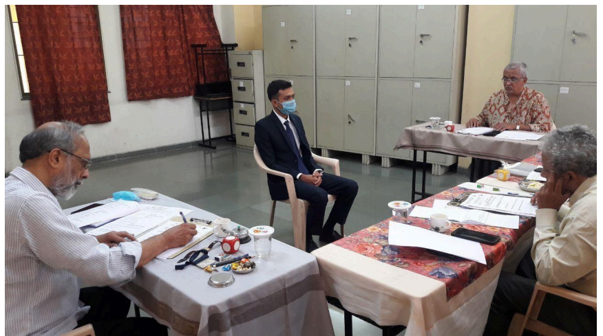
Full Panel Mock Interview in Progress

This program is one of the best facilitation for Personality Test (Interview) all over India through Experience Sharing by Interview appeared aspirants, Personality profiling, Group Activities, Village visit - District/State Study tours and Mock Interviews. The program has been successful and the results are reflected in the above average and 200+ interview marks to many of the program participants.