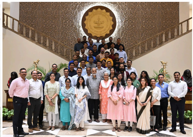
Officers' and Alumni Meet in New Delhi