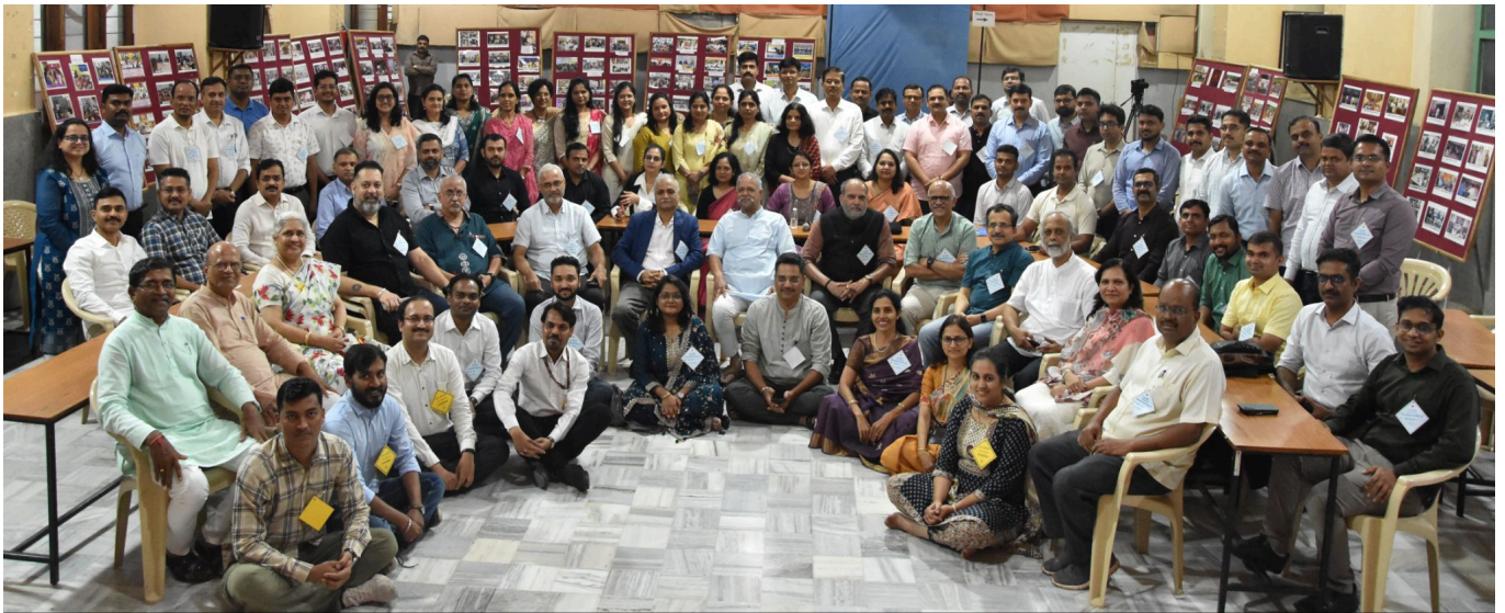
Officers' Get-together at Pune in August 2025

Considering this, in Jnana Prabodhini we try to build the Abilities (Understanding, Memory, Thinking) and the Skills (Reading, Listening, Revision, Writing) of the aspirants. Emphasis is given on Temperament Building & EQ development . To graduate clean, committed & competent officers, efforts are made for Attitude Formation . Students are made to appear for State level public service exams and also advised - guided about alternate career plan A to achieve their Life Goals. Students are given Experiential Learning inputs and helped to monitor the intangible gains that result in the rigorous UPSC journey. Thus, Jnana Prabodhini gives a unique and meaningful education to achieve Life Goals !