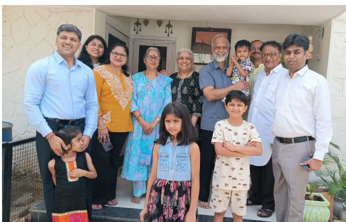
Family visit to officers in Jaipur

Our alumni have also excelled in fields other than civil services. We have expert professionals working in the fields of education, research, journalism, finance, consulting, social service, etc.